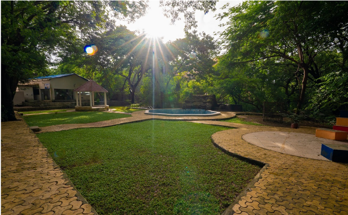
Carparking Garden With Water Fountain